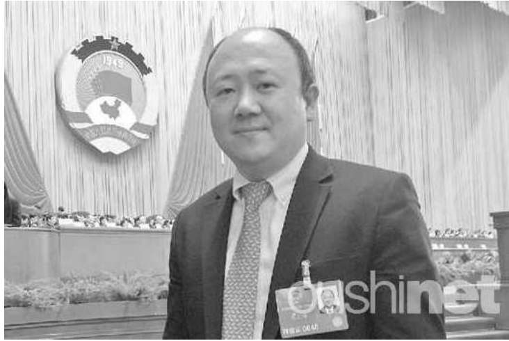
Figure 2: Buon Tan, then vice-mayor of Paris's 13 th arrondissement, attending the 2013 meeting of the CPPCC.

stituent unit of the CPPCC, and its staff generally have backgrounds as Party cadres in united front agencies. 32