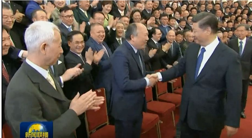
Figure 1: Buon Tan shakes hands with General Secretary Xi Jinping at a 2019 united front event.

CCP's International Liaison Department, which seeks to influence foreign political parties.