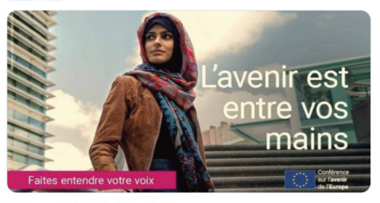
5:37 p. m. · 9 feb. 2022 · Twitter for iPhone

1.065 Retweets 135 Tweets citados 2.635 Me gusta